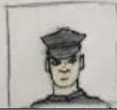
Marine Sgt. Dan Daly