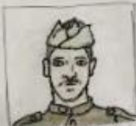
Sgt. Alvin York