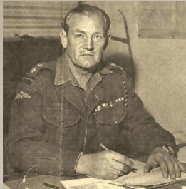
Playset – Vågsøy Raid

Born in 1906, Jack Churchill (no relation to the prime minister) went on to gain fame through his actions in WWII. His military career began when he served the 2 nd Battalion in India, in the year 1926. Upon returning to England, Churchill became a reserve officer and left to pursue a life of acting. He was called back to service at the start of WWII, where he quickly climbed the ranks. Churchill was known for leading his men from the front, as well as fighting with a sword and longbow. He also enjoyed playing the bagpipes to encourage his troops. Churchill eventually became a colonel and led a unit of commandos. Towards the end of the war, he was able to escape two enemy prison camps. Jack Churchill lived until the age of 89.