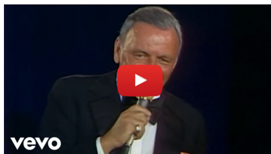
Frank Sinatra's - "My Way"

While I've spent much of my life learning to walk my way —gaining insights, learning lessons, and refining my beliefs—there comes a time when we are invited to walk not just our way, but The Way .