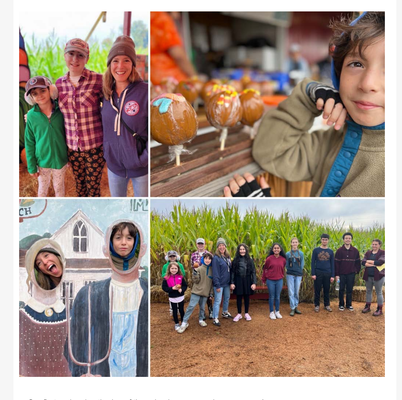
Our first regional gathering of the school year was a huge success!

On Saturday, October 14th we had nine families join us at The Pumpkin Patch on Sauvie Island in Portland, Oregon. We tested our problem-solving skills as we navigated the maze together, then