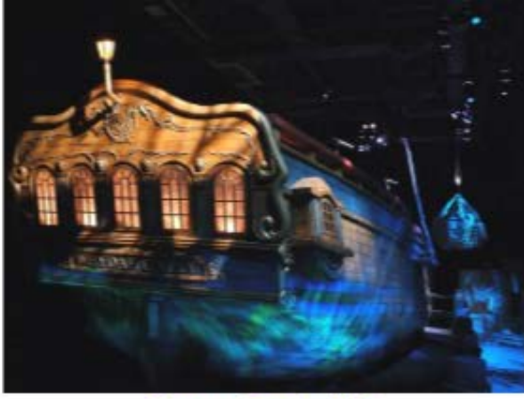
Cape Cod, MA Whydah Pirate Museum