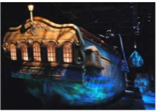
Cape Cod, MA Whydah Pirate Museum

the lookout for an email with additional details and an RSVP link later in January.