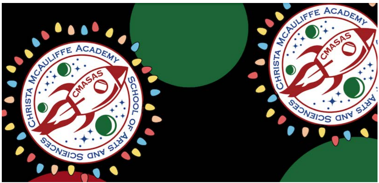
Special Holiday Message from CMASAS IT - Protect from Phishing Emails